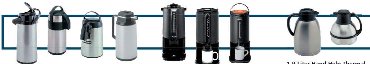
Complete line of airpots are compatible with this model using the Brew Buddy (p/n 3774)

ACCESSORIES: See the Bloomfield Brew Brew product catalog for a complete listing of brewers and accessories.